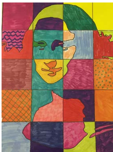
Two very different works inspired by the Mona Lisa.