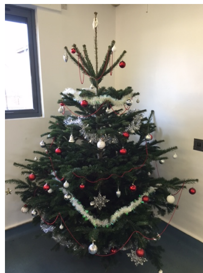
The Phoenix House Tree

I would like to start off by thanking those of you who were able to attend our Review Days over the last couple of weeks. I was so pleased to meet so many of you and to hear your views and opinions of the Academy and the education and support we give to your children. The turnout at this round of reviews was as high as it has ever been since I have been involved with the school, both in terms of parents and schools who attended. I hope that you found it a worthwhile experience. I was delighted with the feedback we received from the parents and carers who attended through the survey we asked you to complete, the time you took to complete it is much appreciated. I will send a summary of the survey's findings to you in the new year so you can see the details.