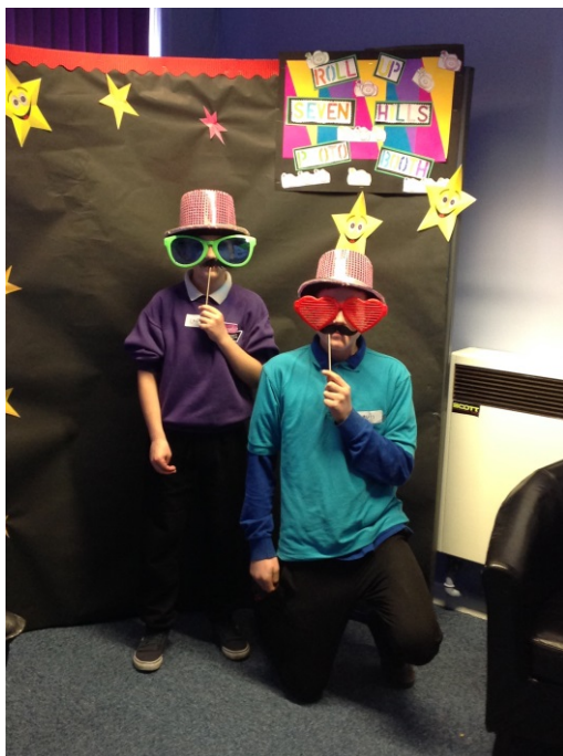
Sevenhills students supporting and working with children from a local Primary School on Community day

Governors, community police officers, parents and a local primary school all enjoyed the great atmosphere and the exceedingly good cakes.